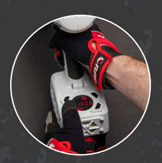
Two-hand start option.