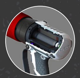
Brushless DC motor for added durability and accuracy.

Take control with the new torque and angle functionality, ensuring comprehensive management of your tasks.