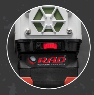
Latch lock to protect battery form falling from high heights.