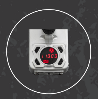
4-button interface with highcontrast LED display provides feedback during operation.